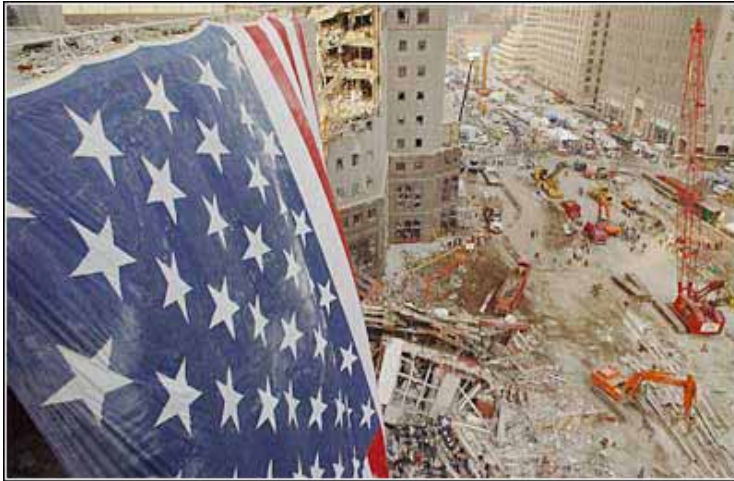
Sept 17, 2001—An American flag hangs above the WTC wreckage.