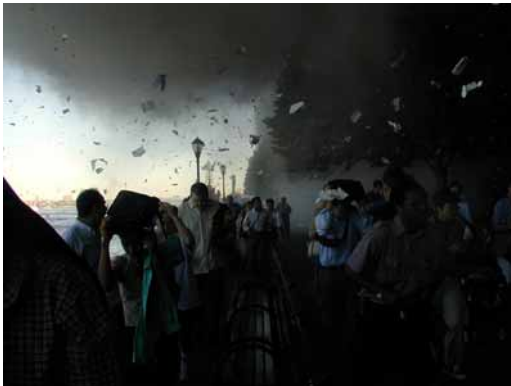
Dust pervades the southwest tip of Manhattan—9:57 a.m.

Among some of the major criticisms: The city should have been prepared with respirators and safety equipment at the time. Of course, some of that problem was due to the tragic loss of firefighters with hazardous materials expertise. Many remember the mad scramble to get respirators on the first day. But critics also blame fundamental lack of coordination among agencies and little regard to environmental health and safety.