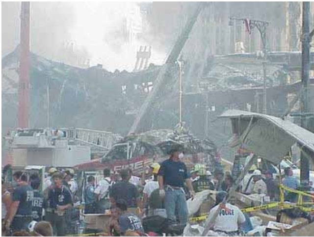
Volunteers and professionals helped with recovery at Ground Zero.