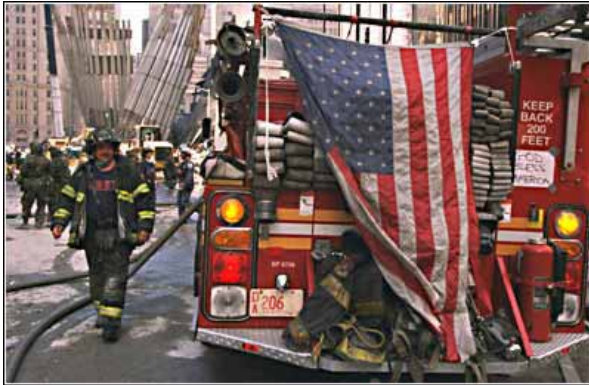
Sept 13—Firefighters battle the WTC fires and wreckage.

Authorized food, too, had a shelf life, of course. “There were piles of beef brisket sandwiches on crash carts with Gator Ade and granola bars. But that all started to pile up too,” he says.