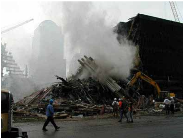
Some monitoring was done on the burning debris pile at Ground Zero.

At the Pentagon, by contrast, suggests Dodie Gill, of the Arlington County Employee Assistance Program, officials from different departments – Police, Fire, and Health – seemed to be more used to working together. The EAP itself crosses various official specialties.