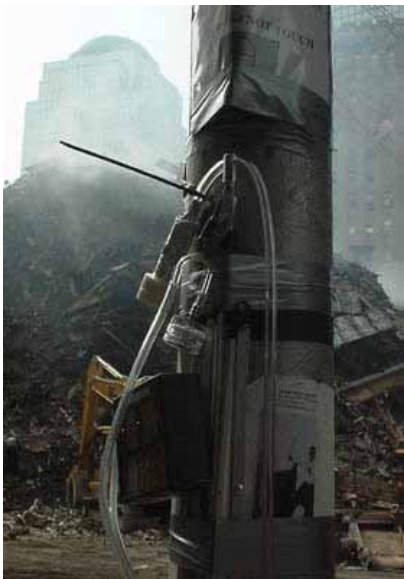
Air monitor near a debris pile.

A challenge for local officials was interpreting environmental monitoring data from the various agencies—as different agencies were coming up with different levels and measuring for different contaminants. According to the Region, it “used established standards where they were available and modified guidelines” to produce benchmarks. For example, it used PELs (Permissible Exposure Limits) for lead, certain volatile organic compounds (VOCs), and asbestos. Otherwise it put together ad hoc benchmarks, for substances like dioxin and PCBs.