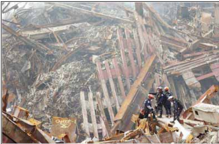
Sept 21, 2001—FEMA rescue workers.

Matters were not so straightforward when it came to coordinating who was doing what with respect to environmental health.