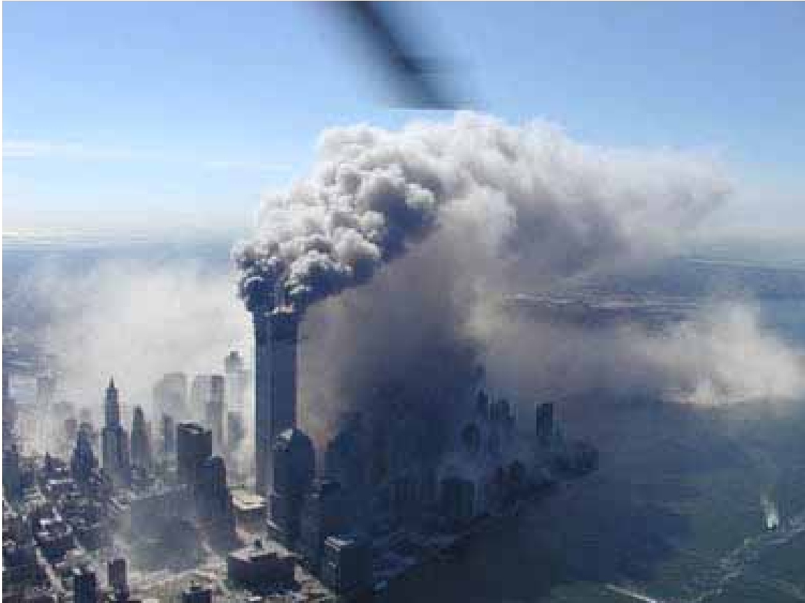
The North Tower as seen from a NYC police helicopter.

It was America's longest day. Beginning at 8:46 a.m. on September 11, the world stood aghast as jets, transformed into missiles, leveled the highest towers in the nation's capital of finance, one after another, then as another jet an hour later sliced into the Pentagon. In the flames and collapse of steel and concrete, the terrorist attacks left thousands dead, urban landscapes physically devastated, and the country as a whole in a state of psychological shock. People were to witness an unfolding environmental health disaster.