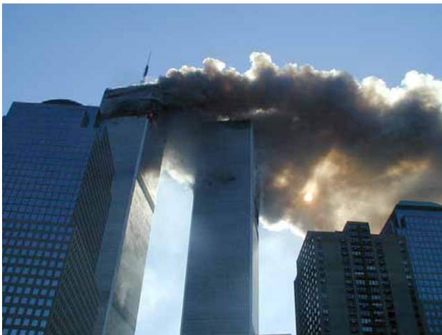
WTC towers at 9:54 a.m.

The terrorist attacks on the World Trade Center and the Pentagon were attacks on two of the largest office buildings. But the lessons learned there apply to any facility that might be the target