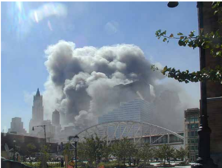
Dust fills the city—11:03 a.m.

And in the first 24 hours, it was the local environmental health department professionals who faced unprecedented challenges, including mountains of dust and debris containing mostly pulverized cement, fiberglass, glass, and building materials but as yet unknown and varying amounts of toxic metals, plastics and other compounds, and burning plastics and fuels as well as smoke and fumes from the building fires.