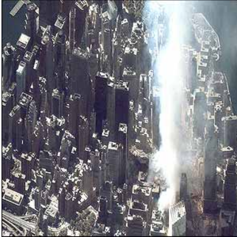
Satellite image of Manhattan, NY—Sept 12, 2001.