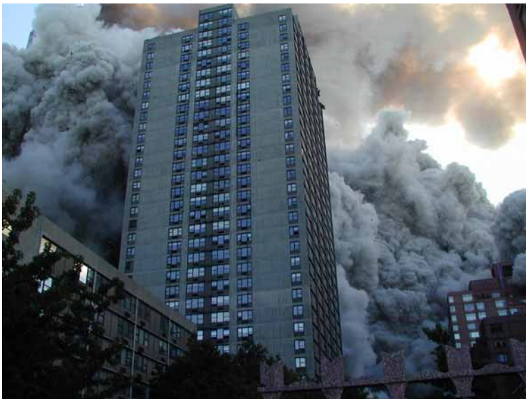
Tower One collapsing—9:56 a.m.

In New York, the collapse of the towers and nearby buildings created a vast, 16-acre disaster zone. The towers were so high and the “pancaking” effect so forceful that extraordinarily destructive forces were unleashed.