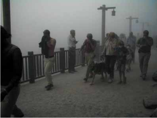
Dust fills the air—10:05 a.m.