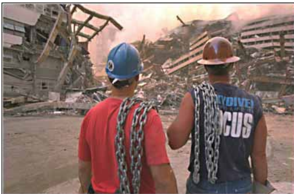
September 13, 2001—Ironworkers look at the WTC site.

From the very beginning, Revella helped enlist the aid of ironworkers to begin taking apart the charred remains of the World Trade Center and other buildings downtown. The cleanup needed anyone available who could cut steel. (21)