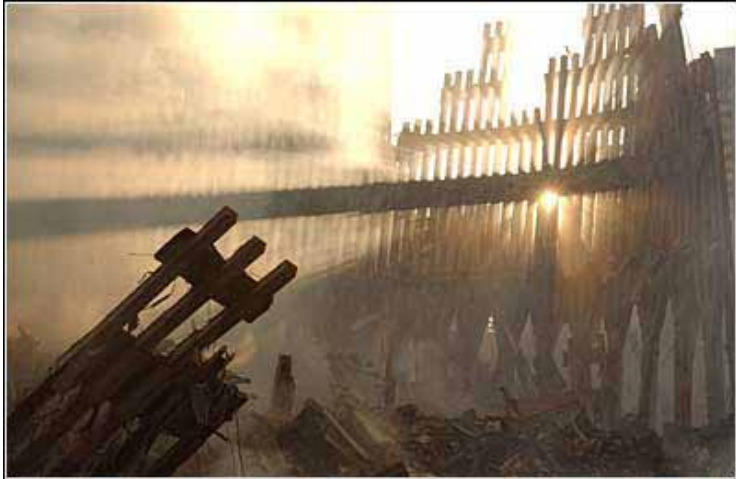
Sept 15, 2001—The sun streams through the dust over the WTC wreckage.

Ask environmental health experts and local health officials about how they performed on September 11, and you're likely to get the same response: People responded admirably, especially given the unexpected and unprecedented nature of the attack.