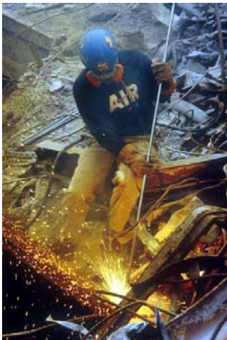
Cleanup at Ground Zero.

“For more than a year a profound split troubled New York journalists on how to cover and play this unfamiliar new threat,” according to a memo from the Society of Environmental Journalists on the issue. “One set of journalists was accused of being ‘alarmists’ pushing fear to raise ratings; another was accused of being lapdogs placidly accepting EPA reassurances. Good information was hard to find.”