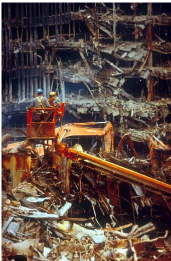
WTC site.

It was a mistake to have local agencies manage the environmental aspects of the crisis, according to Lioy, because “the local agencies were not prepared to respond to a disaster of this scale.”