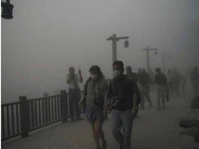
Decreased visibility—10:05 a.m.