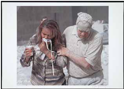
Ash covers bystanders.

In New York, that first day, however, the WTC disaster would overwhelm the public agency but not in ways that they traditionally do—by putting demands on hospitals, medical workers, hospital bed capacity and the like. In fact, doctors clamored to the site to try to help, only to discover that there weren’t enough victims to help.