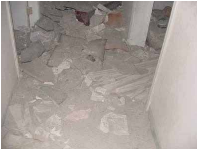
Heavy dust accumulated in a store near the WTC site.

A significant vacuum here was that the agencies didn't address the hazards right under people's noses—in interior spaces—as Rep. Jerrold Nadler (D-N.Y.), the congressman whose district includes the neighborhoods surrounding Ground Zero, would charge in congressional hearings months later.