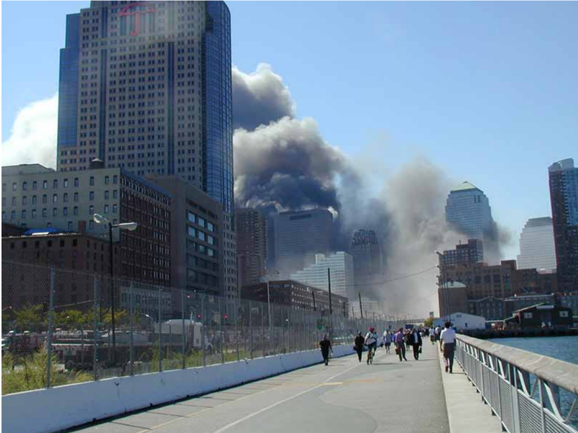
People flee and look back at the dust cloud from the fall of the towers—11:10 a.m.