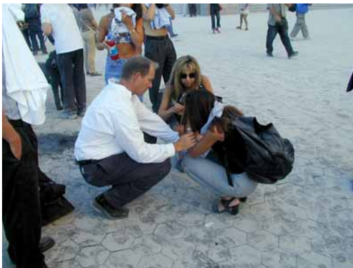
Consoling one another after the attacks—10:18 a.m.

That is not to say that the terrorist attack didn’t tax the hospital and healthcare system’s resources. The NYU Downtown Hospital, a few blocks from WTC, suffered power failures on September 11, as did others. And even the city’s Department of Health, close to the disaster site, was turned into a triage area for the hordes of people suffering from smoke inhalation, minor cuts and bruises and respiratory ills.