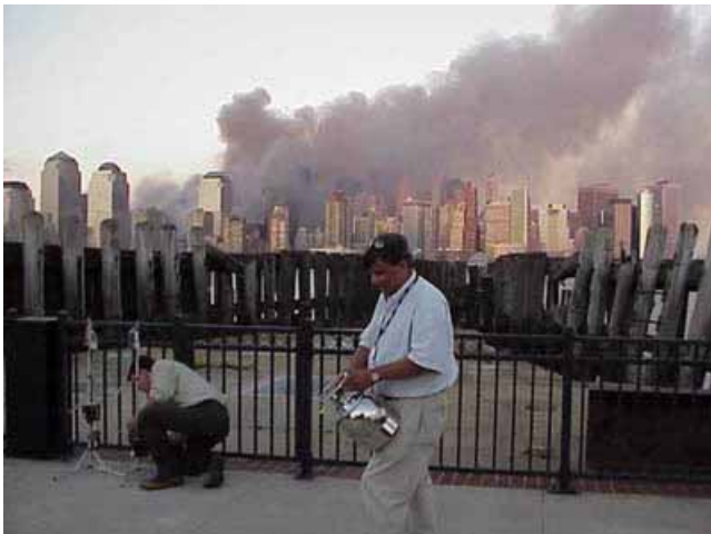
Setting up air monitors in New Jersey.

Plus, the contaminants were not uniformly dispersed—so that one could find high levels of certain pollutants in one area and not in another. They were heterogeneous, random mixtures of everything in the buildings—plastics from furniture, mercury from lightbulbs, including exotic metals like vanadium from computer parts.