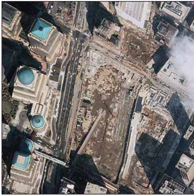
Satellite image of Manhattan, NY— September 4, 2002.

Two years after terrorists attacked the United States, the target sites have long been cleared away and scraped clean. At Ground Zero, where the twin towers and other buildings of the World Trade Center complex stood, builders are designing memorials and the community has been working at the hard effort of recovery. The Pentagon's damaged Wedge was rebuilt within months.