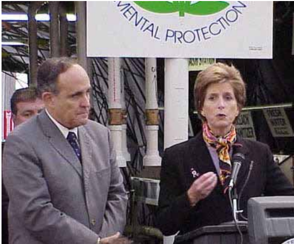
Mayor Giuliani and Administrator Whitman.

Nevertheless, at the top levels of government, officials continued to insist there were no real long-term hazards to the general public. Several weeks later, a reporter for CNN.com wrote, “The smoke may be unpleasant, city, state and federal health officials agree—but it's not a health threat.” The mayor was reported saying: “It may be uncomfortable and it may be offensive—and it is in many ways—but the reality is, it is not dangerous,” New York Mayor Rudy Giuliani said. (10)