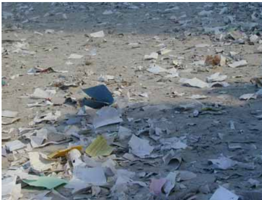
Paper blew from the towers and surfaced on the plaza.