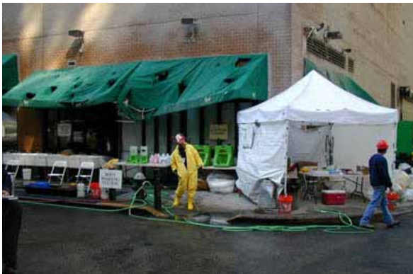
WTC wash station.

Yet there were occasions when that standards was used, as when there had to be clean up of underground tanks, covered under HAZWOPER, rather than under the Comprehensive Environmental Response, Compensation and Liability Act (CERCLA, or Superfund).