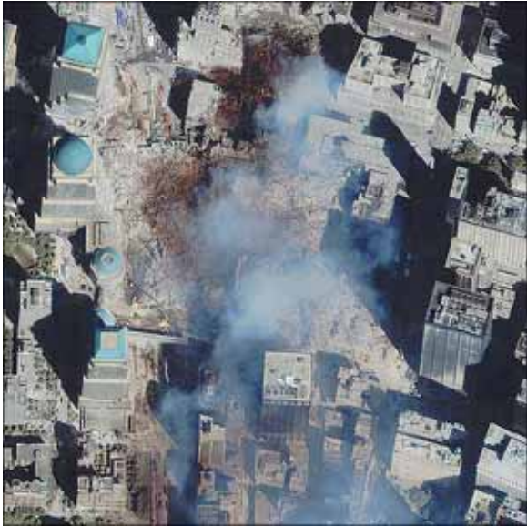
Satellite image of Manhattan, NY—Sept 15, 2001.

In the aftermath of the World Trade Center disaster, hundreds of thousands of New Yorkers fled lower Manhattan. Once they had absorbed the shock of the tragedy, and began to return to their homes and offices, however, they were urged to try to return to normal.